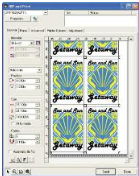
Flexi gives you a complete design, RIP and print application in one great product!