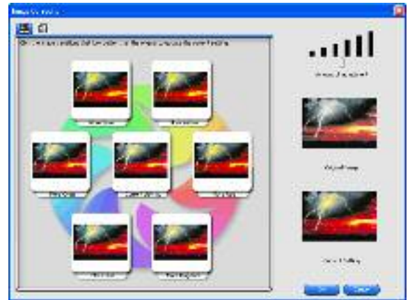
PhotoPrint helps you easily color correct your projects with the Variations feature in the Print Wizard.

You can define two media sizes to be used simultaneously, and print from any application! No matter which PhotoPRINT version you choose, you'll be sure to save time and confusion while increasing your productivity.