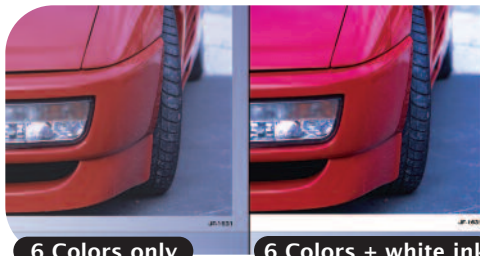
6 Colors only

Mimaki's JF Series Flatbed printers produces brilliant color on rigid materials up to 66" wide and 125" long.