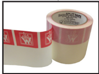
HORIZONS SPLIT TAPE

Horizons Split Liner Tape has both adhesive and non-adhesive backings to keep your mesh and frames spotless, and to reduce time spent on labor and cleanup. This translucent white tape will not break, leave residue or damage emulsion. It is also easy to remove when it times to reclaim the screen.