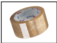
ipg intertape polymer group™

Intertape's heavy duty clear tape is an economical alternative to the premium blockout tapes. Its heavy gauge and natural rubber adhesive allows for removal with minimal residue.