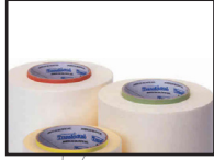
AMERICAN BILTRITE INC.

This heavy duty pallet mask will protect your pallets from adhesive and provide a smooth, consistent printing surface. It is easy to apply and remove, and will withstand the most demanding print applications. Also ideal for masking equipment, the floor, and any other surface requiring protection.