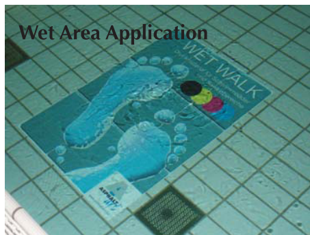
Wet Area Application

CatWalk is an opaque , printable media with anti-slip qualities that is perfect for all of your indoor advertising needs. Whether on the floor of a supermarket, a mall, or at the bottom of a pool—CatWalk from Asphalt Art makes a statement!