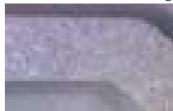
Conductive silver track printed with Autotype Capillex CX

It provides a consistently low but controlled stencil profile over a wide mesh range (62-100/cm). The optimised balance of profile and Rz gives Autotype Capillex CX superb print reproduction. A prerequisite when printing conductive inks.