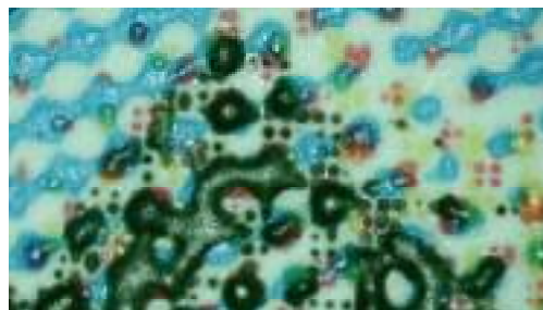
Ink skipping caused by high EOM of conventional stencil

Autotype Capillex CP will consistently give a low controlled stencil profile on a mesh range of 120-180/cm but is particularly suitable for printing fine halftone images with UV ink on 150 or 180/cm mesh, making it the perfect product for demanding applications such as CD and ceramic decal.