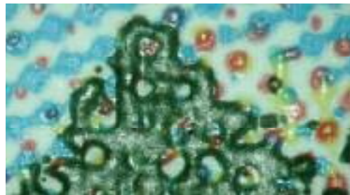
Excellent dot reproduction from the low EOM of Autotype Capillex CP